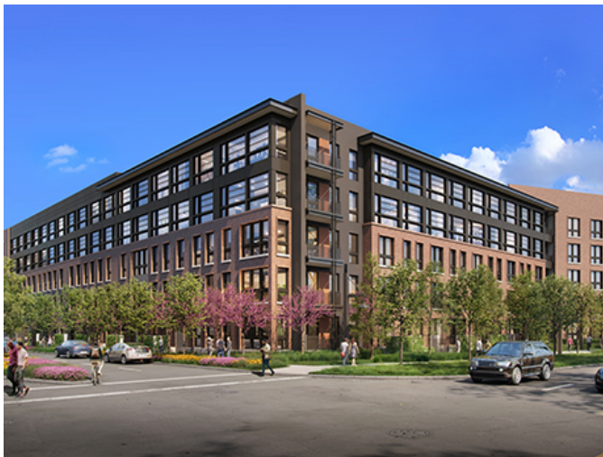
The Laura, a multifamily project at Midway's East River development in Houston, will total 360 units.