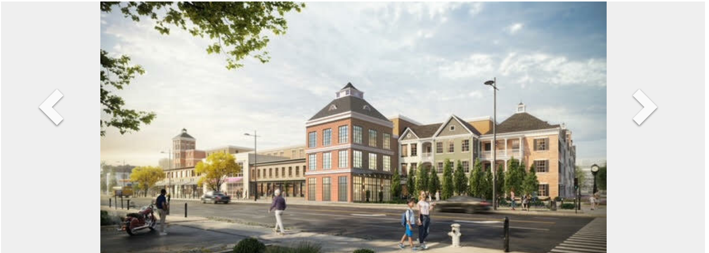
A rendering of the Heatherwood luxury apartment complex.